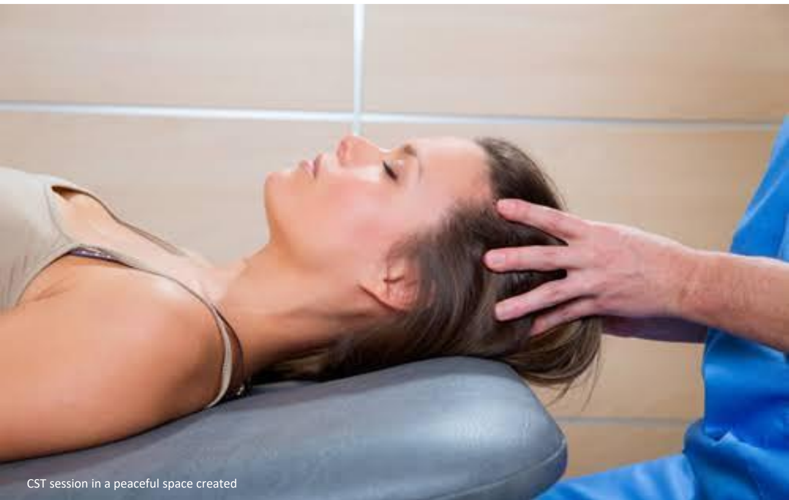
CST session in a peaceful space created

Craniosacral therapy (CST) is a form of Osteopathic manipulation. The Osteopathic concept was introduced in 1870 by Dr AT Still and is one of the oldest sciences of healing. It is about recognizing and accelerating the body's natural ability to cure itself and correcting mechanical disorders by applying therapeutic manipulation of bones and muscles.